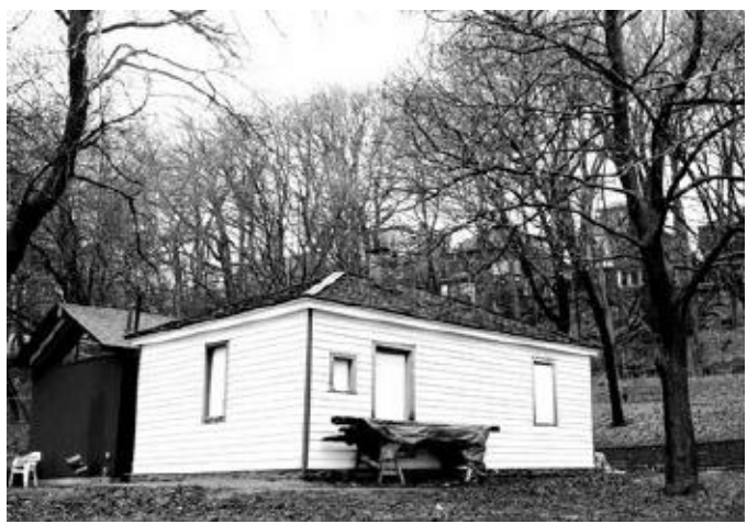
The Tollkeeper's cottage in Davenport Square Park

On July 1st, Canada's oldest toll house will open to the public as a museum at the intersection of Davenport Road and Bathurst Street. A classroomsized addition will serve as an interpretive centre. It is thanks to the efforts of countless volunteers under the stewardship of the Community History Project (CHP) that this rare old structure has been restored and replaced as close as possible to its original location.