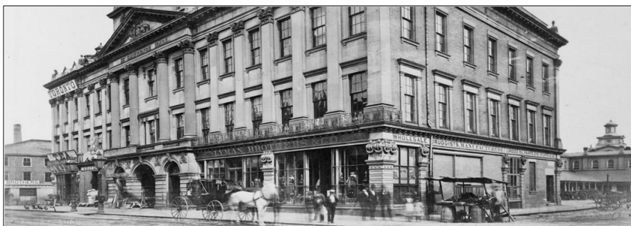
St. Lawrence Hall, 1885.

On Wednesday, March 6, it will be 185 years since Toronto became a city.